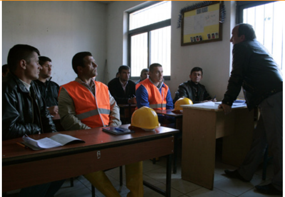
Photo: Miners from Vlahna Village in Kukes receiving training in occupational safety and health

The One UN Joint Programme Youth Employment and Migration: Reaping the benefits and mitigating the risks is jointly implemented by ILO, IOM,