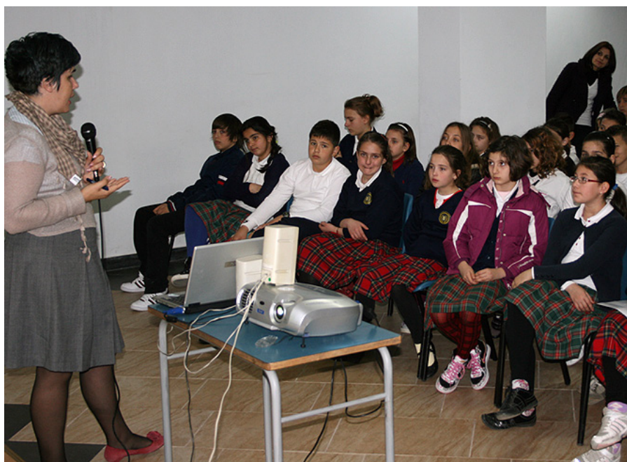
Photo: Students from Ylber School in Tirana learn about the science of climate change during one of the environmental awareness activities.

The activities were organized with the support of the UNDP EU Environment