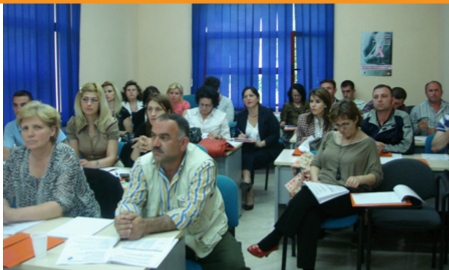
Photo: UNODC-WHO Joint Program trains practitioners on evidence-based drug dependence treatment and care