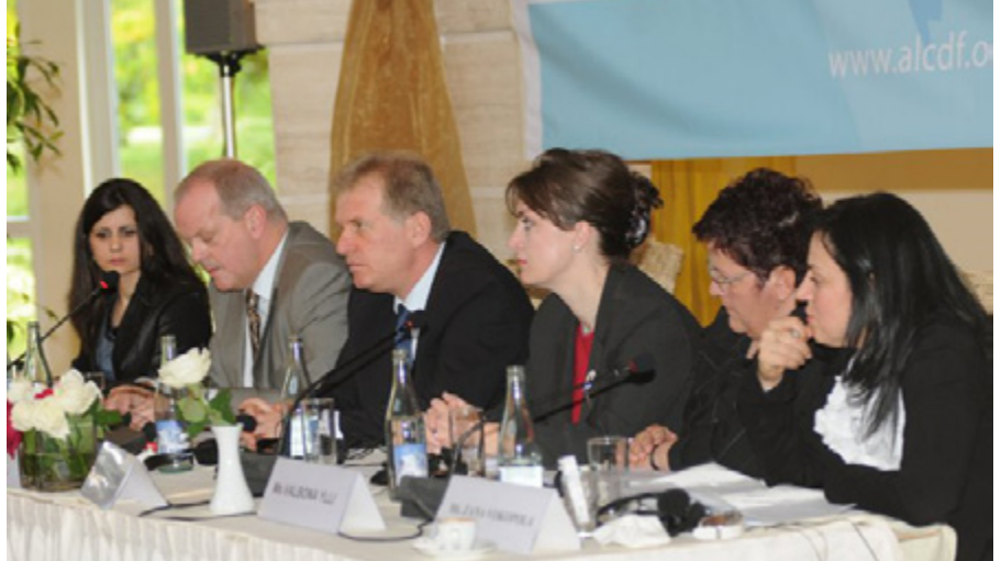
Photo: Launching ceremony of ALCDF Activities

On 17 May 2011, the Albanian Local Capacity Development Foundation (ALCDF) officially launched its activities in Albania. Participants included the Minister for Innovation and Information and Communication Technology, Genc Pollo, senior government representatives,