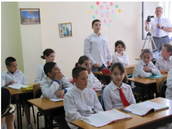
Photo: PAMECA Road Safety Training at Schools

This training is a contribution of the European Union Delegation in Albania delivered through PAMECA III to help the Albanian State Police approach EU standards. This is the first time in Albania that it is mandatory for the Albanian State Police (ASP) Traffic Directorate and the respective teachers to hold joint lessons in traffic education in schools and this will reflect in the curriculum of the Ministry of Education & Science in the next school year. Such trainings will go on in the future in other relevant areas of Traffic Police.