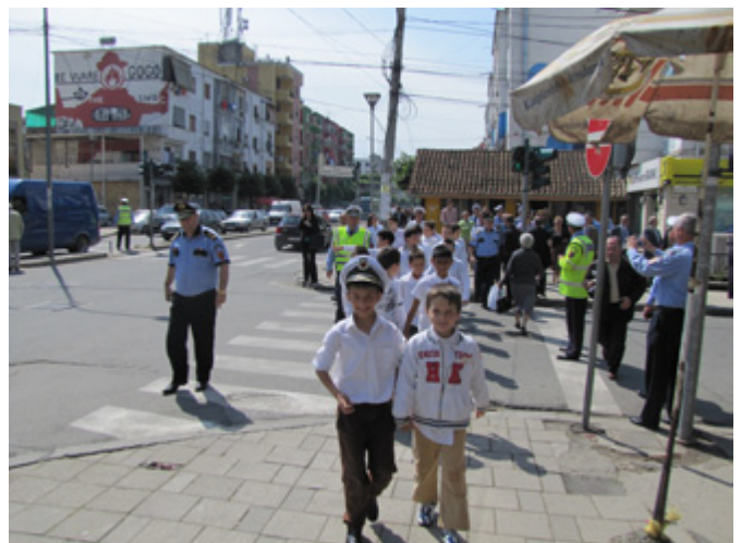
Photo: PAMECA Road Safety Training in the Field