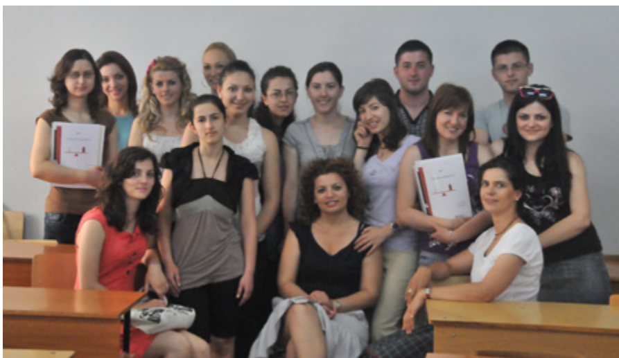
Photo: Law Students at the seminar Gender and Law

The Open Regional Fund for South Eastern Europe – Legal Reform comes within the remit of the component for the “Regional Implementation of the Alternative Dispute Resolution (ADR) Instruments” and organised a seminar at the Law Faculty in Tirana. Throughout the summer term, from March to June 2011, law students were introduced, once a week for an hour, to the main national and international legal acts and were also exposed to a variety of legal discussions. The students had to actively participate by preparing exposes and/or by preparing discussion topics that were related to