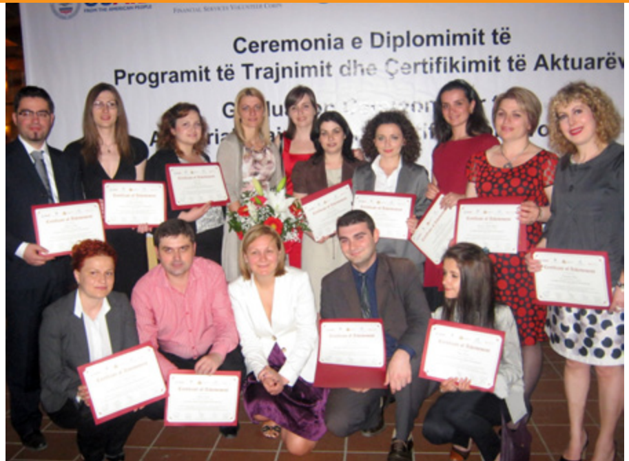
Photo: Fourteen graduates received diplomas and certification to be licensed as professional actuaries to support Albania's growing insurance and banking sectors

Actuaries are risk managers who provide important services to banks and