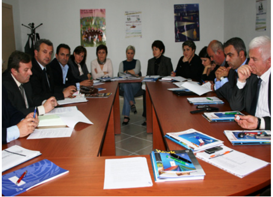
Photo: The roundtable to mark World Day for Safety and Health at Work

On 4 May 2011, to mark World Day for Safety and Health at Work, the ILO in Albania, in cooperation with the State Labour Inspectorate, organized a roundtable entitled Man-