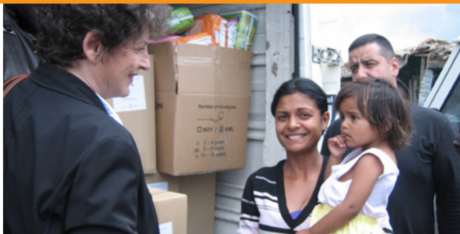
Photo: Swiss Ambassador Yvana Enzler, visits areas and communities affected by floods in Shkodër

In addition to conforming dam safety to European standards, the new grant will ensure the protection of people living downstream of Drin and Mat rivers. Moreover, this will also guarantee the continuous hydropower production from 5 hydro power plants that represent 90% of Albania's energy produc-